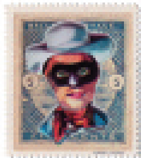
Above Above top:

getting started with faux postage/artistamps can be a challenge, simply because as a newer art form it is not as well documented. Somebody interested in oil painting or sculpture starts by buying a kit, taking a class, or getting a book from the library. These options rarely exist for faux postage, which can be as simple as sketching or as complex as high-end mixed-media art.